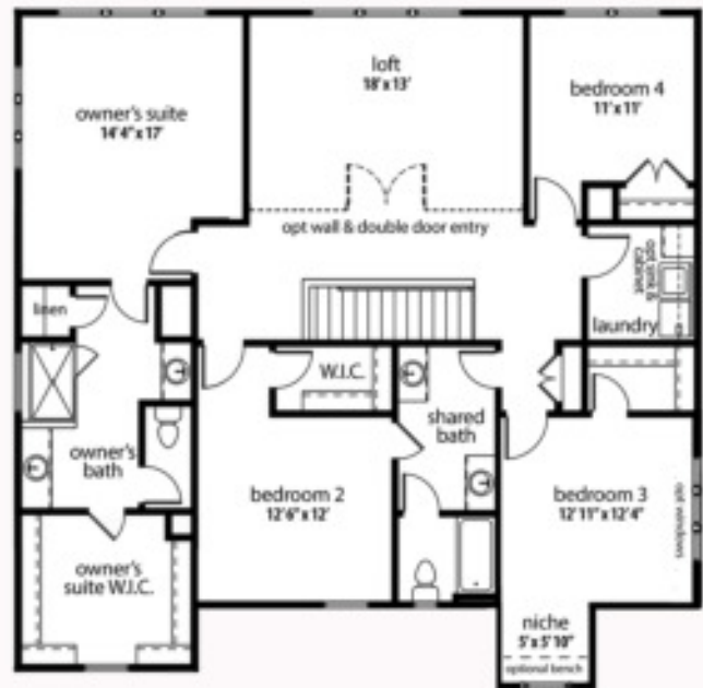
opt tub in owner's bath