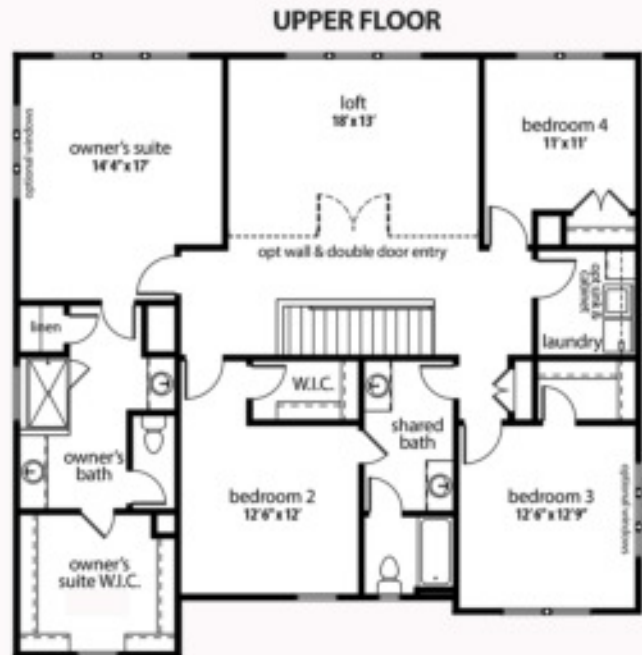
opt tub in owners bath